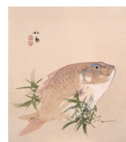
竹内栖鳳 《艸影帖・色紙十二月のうち「鯛(一月)」》 Takeuchi Seihō The Twelve Months in Paintings: Sea Bream (January)

栖鳳の鯛の絵と、恵比寿の地名をかけて、おめでたい和菓子銘としました。あんは風味豊かな胡麻入りのこしあんです。 (胡麻入りこしあん) Smooth red bean paste with ground sesame seeds (Gomairi-an)