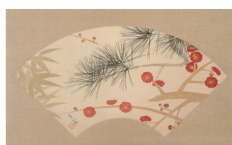
小林古径 《松竹梅》 Kobayashi Kokei Pine, Bamboo, and Plum

扇型の練切りの上に、松竹梅を取り合わせた華やかでめでたい一品。杏の風味と菊家特製のこしあんをお楽しみいただけます。 (杏入り練切り・こしあん) Smooth red bean paste with shredded apricots (Anzuiri-an)