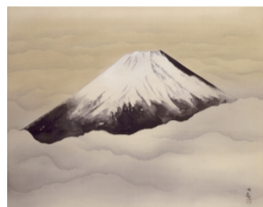
横山大観 《心神》 Yokoyama Taikan Divine Spirit: Mt. Fuji

山種美術館設立に際して大観から特別に購入を許された《心神》。雲海に包まれた気高い富士の姿をきんとんと羊羹で表しました。 (黒糖風味大島あん) Smooth red bean paste with brown sugar (Kokutoiri-an)