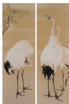
西村五雲 《松鶴》 Nishimura Goun Cranes and Pine Tree

動物画を得意とする五雲が描いた丹頂鶴。古くより、長寿のシンボルとされてきた鶴の姿をイメージした和菓子です。 (こしあん) Smooth red bean paste (Koshi-an)